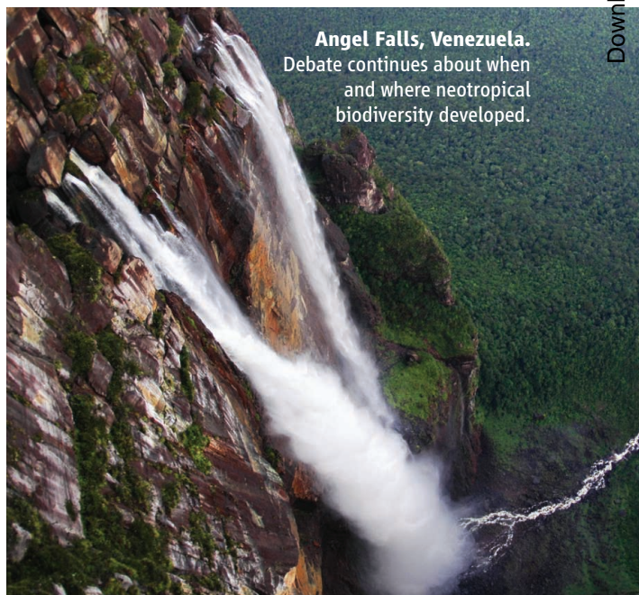
Angel Falls, Venezuela.

Rull's suggestion that we overestimated pre-Quaternary diversification by using genera instead of species as taxonomic units in our meta-analysis is misleading. Extinction is more likely to affect older lineages than younger ones—simply because species that have arisen recently have had less time to go extinct (6)—meaning that Pre-Quaternary speciation events were probably underestimated in Rull's meta-analysis (3). Stochastic diversification models (6) can correct for the effect of background extinction in diversification rate estimates, but these models have proven unrealistic because of their oversimplified assumptions (7) and sensitivity to incomplete taxon sampling (8), a common feature in Neotropical phylogenies. Estimates of crown ages of genera are, arguably, less sensitive to incomplete taxon sampling, because in most species-level phylogenies, sampling is aimed to cover the geographic and morphological variation within a genus. This should lead to more robust age estimation of deeper nodes even when many species are missing.